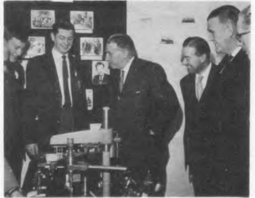
At the Irish Shipping Limited 21st Anniversary Maritime Exhibition, Mansion House, Dublin, March, 1962.