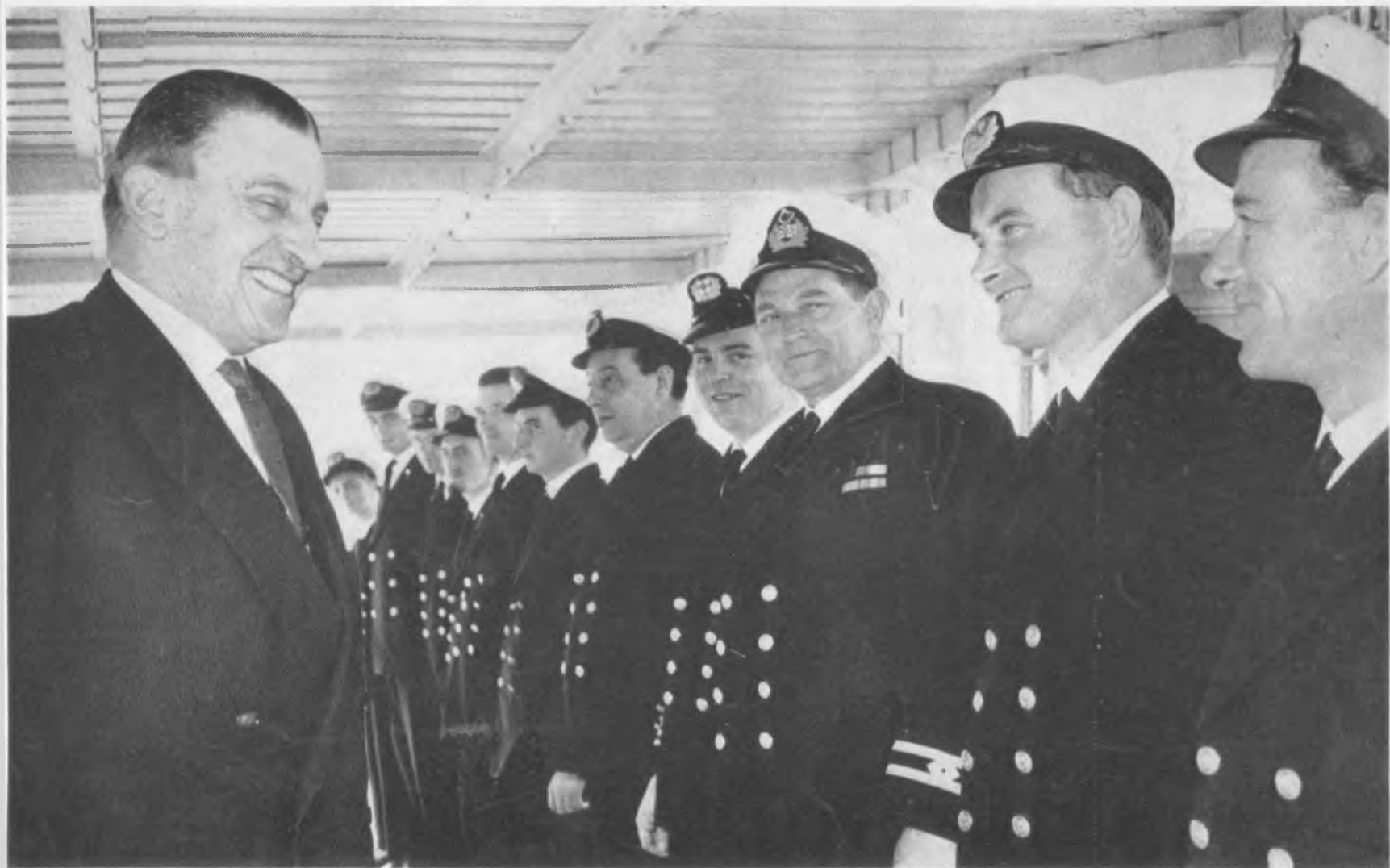
Mr. Lemass visited the "Irish Sycamore" when the vessel made its first call to Dublin in May, 1962.