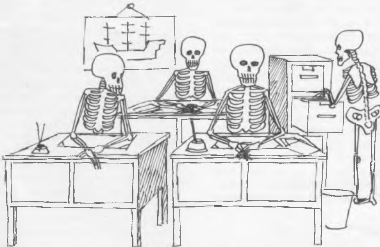
Cargo Dept., Christmas Eve.

We wish all our readers, ashore, at sea, in Ireland and abroad, a Very Happy Christmas and good fortune during 1967.