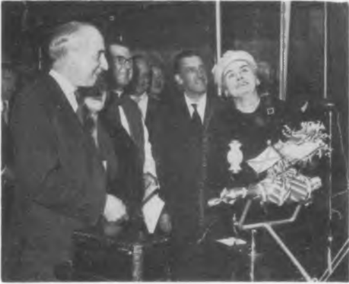
Mr. and Mrs. Sean Lemass at the launching of the "Irish Hawthorn" in August 1957.