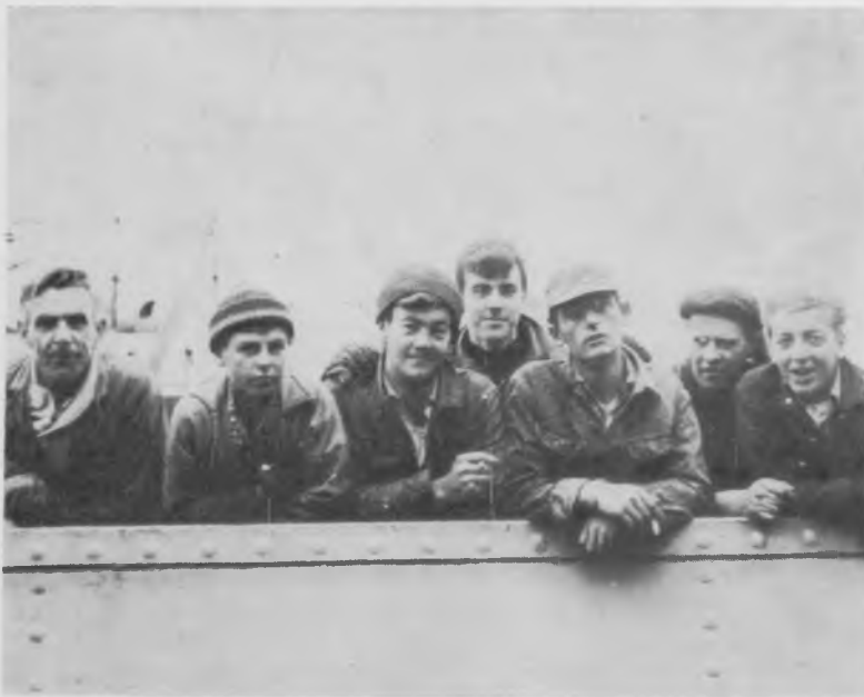
Some of the crew of the "Irish Spruce" pictured on board the vessel at Dublin.