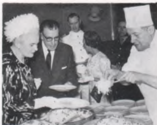
Mr. and Mrs. Sean Lemass are served at the buffet table.