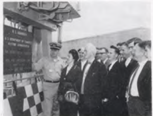
Members of the Cork Harbour Commissioners are conducted around the ship.