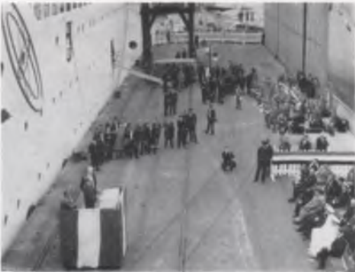
A general view of the quayside during the arrival ceremony for the "SAVANNAH."