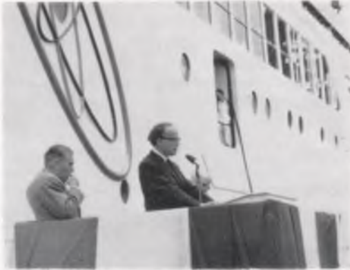
Mr. E. Childers, Minister for Transport and Power, speaking at the arrival ceremony.