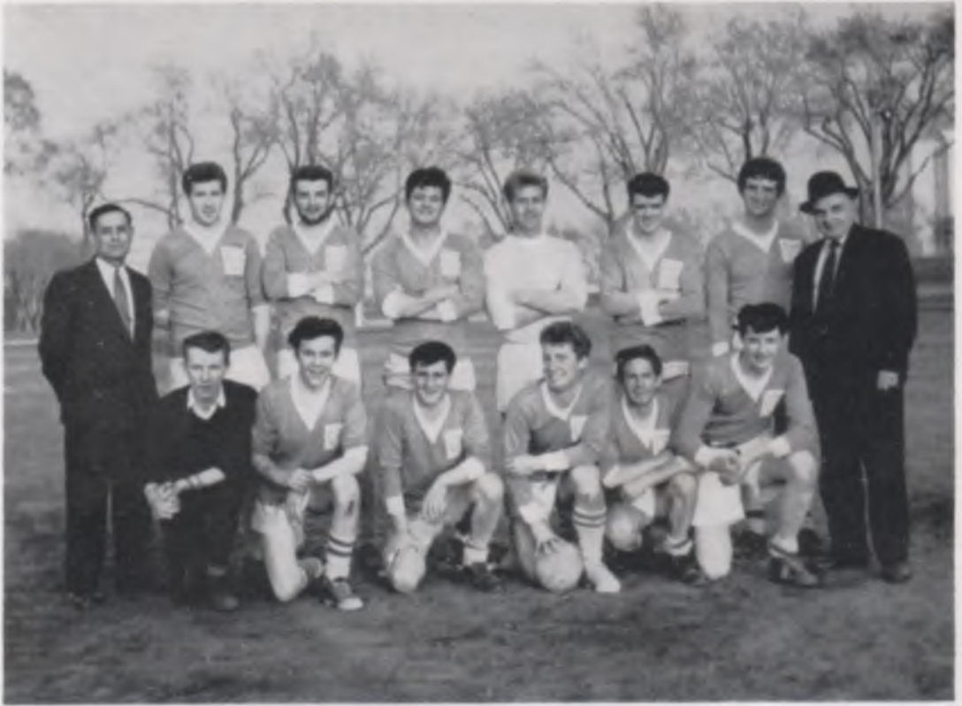
This is the "IRISH ALDER" football team which recently played a team from the Torr Head at Montreal.